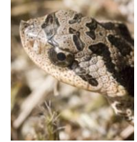
E. Hog-nosed Snake (hypothetical)