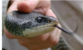
North American Racer