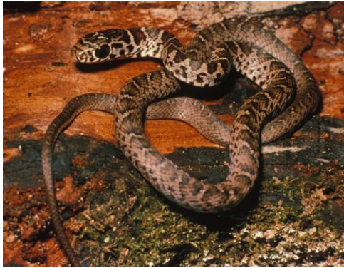
North American Racer