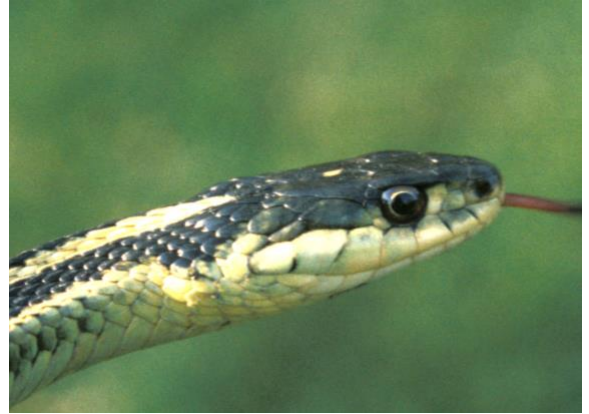
Common Gartersnake (common in Vermont)

Yellowish upper lip Dark green on top of head No black line behind eye No vertical white bar in front of eye Yellowish "ear" spots