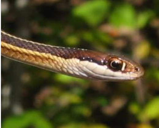
Eastern Ribbonsnake (rare in Vermont)

Bright white upper lip Mahogany on top of head Straight black line behind eye Vertical white bar in front of eye